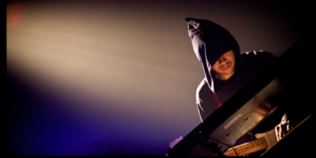
Secret Chiefs 3: A History